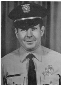
Director, Bureau of School Safety Patrol